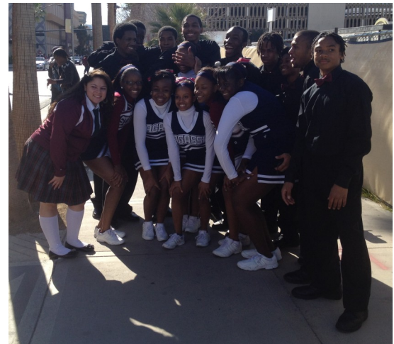
Martin Luther King Parade